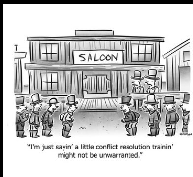
"I'm just sayin' a little conflict resolution trainin' might not be unwarranted."