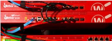
Total Security Suite